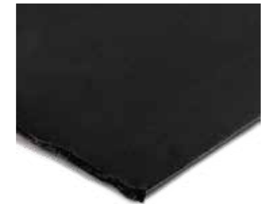
Corn Starch Film

Zero waste- biodegradable, compostable and edible. Renewable resource- rows quickly and can be harvested right away.