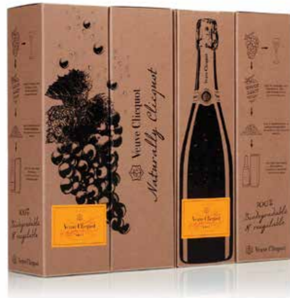
Grape Skin Paper

Can be produced from a variety of materials, including PVC, PU, cork, wine, mushroom, pineapple and more. Level of sustainability and biodegradability depends on the base materials.