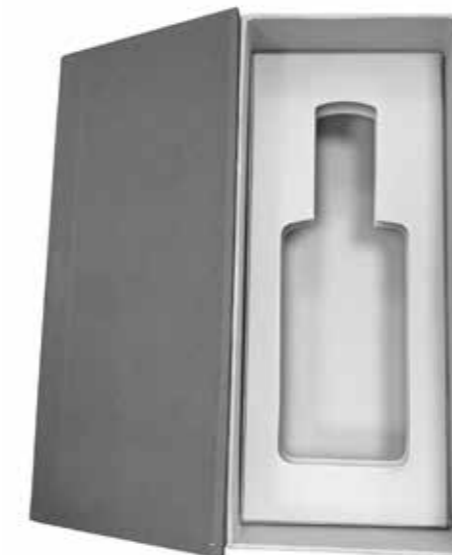
Multi Layer Paper Pulp Insert